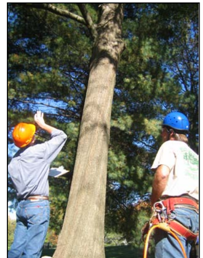
Certified Tree Worker Skills Test